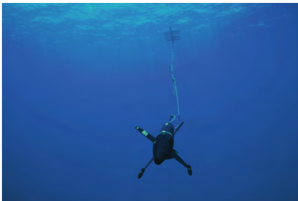
Massive Towing Capability — Tow cable assembly attached to Wave Glider sub