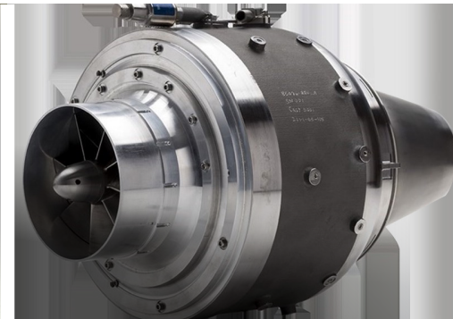
TDI J85 Engine