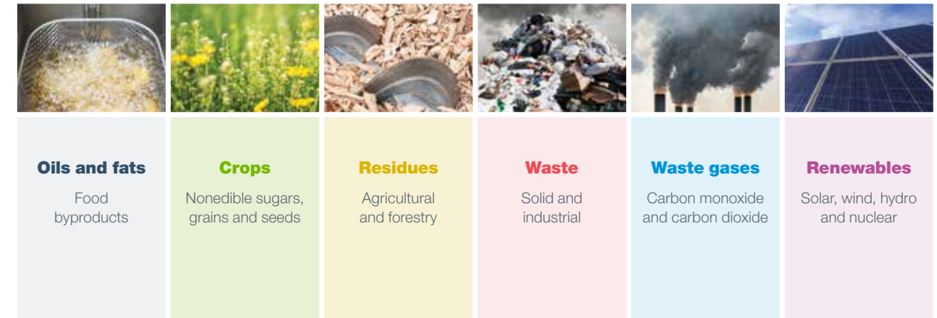
GRAPHIC: BOEING PHOTOS: GETTY

A variety of feedstock sources give power to SAF