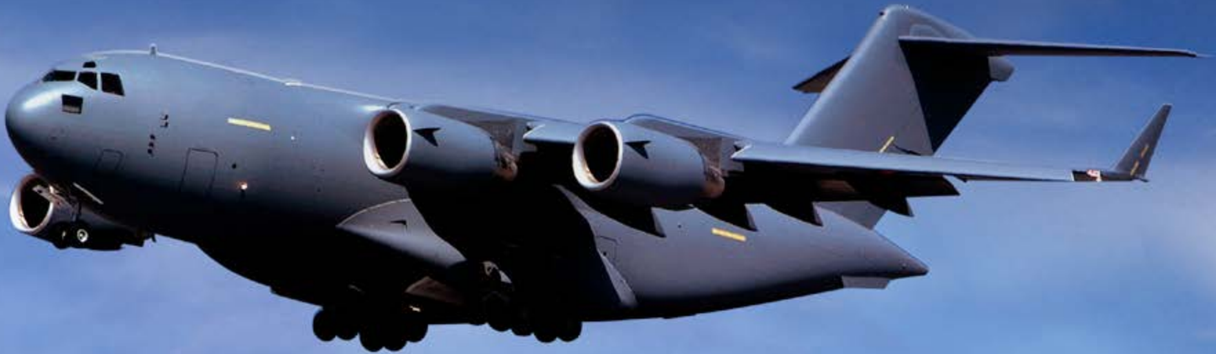
Boeing C-17 Globemaster III transport