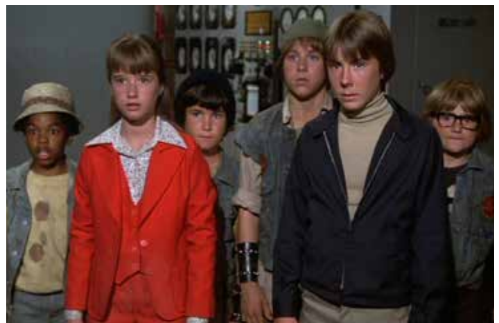
Return from Witch Mountain (Disney, 1978) starred Bette Davis and Christopher Lee.

the nation, and that includes its ranching and movie history. After all, engines – from the short-range post-World War II Redstone to the huge Saturn-V that took man to the moon – were tested at a place once known as Sky Valley Ranch.