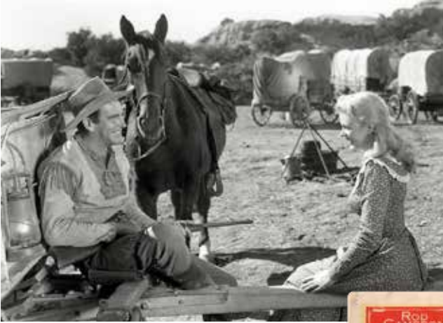
Rod Cameron and Anita Louise in Wagons West (Republic, 1940).

needed a large and remote location to test them. NAA leased, and later bought, 540 acres to the immediate east of Sky Valley Ranch from the Dundas family; the acres were previously leased by Sage Ranch. By 1954, the “Rocketdyne and Power Division of North American Aviation” purchased Sky Valley Ranch from the Silvernals and Halls. Sky Valley Ranch was subsequently divided into what became known as Areas I, II, III and IV. The field lab was renamed