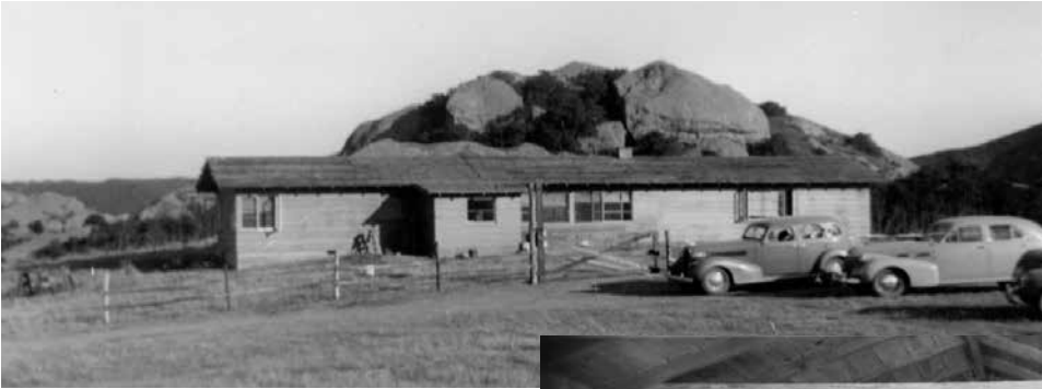
The Silvernale Family established Sky Valley Ranch at Burro Flats in 1939.

During its 15-year existence, some of the land at Sky Valley Ranch was dry-farmed, which meant crops were cultivated without irrigation. The other areas of the ranch were used for raising cattle.