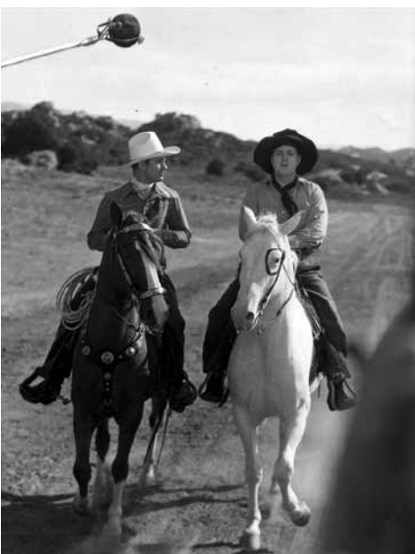
Gene Autry in Rovin' Tumbleweeds (Republic Films, 1939).

The rugged open terrain and majestic rock formations interspersed with sculpted oak trees made the area a natural choice for country living. It was also a picturesque setting for motion pictures. RKO and Republic Pictures approached Henry Silvernale about using his property for movies and television shows and they entered into a filming agreement.