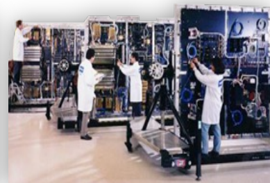
Payload Integration & Test