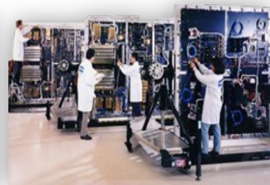
Payload Integration & Test