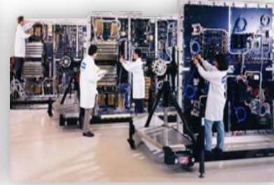
Payload Integration & Test