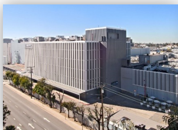
Exterior of Boeing Satellite Factory

Boeing's satellite systems business is located in El Segundo, Calif. The world's first geosynchronous communications satellite, Syncom, was built there by Boeing and launched in 1963. Since then, Boeing has delivered more than 300 satellites to more than 50 customers in more than 20 countries, and continues to design and build government and commercial satellites in its factory in El Segundo.