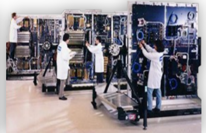
Payload Integration & Test