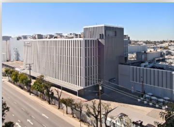
Exterior of Boeing Satellite Factory

Boeing's satellite systems business is located in El Segundo, Calif. The world's first geosynchronous communications satellite, Syncom, was built there by Boeing and launched in 1963. Since then, Boeing has delivered more than 300 satellites to more than 50 customers in more than 20 countries, and continues to design and build government and commercial satellites in its factory in El Segundo.